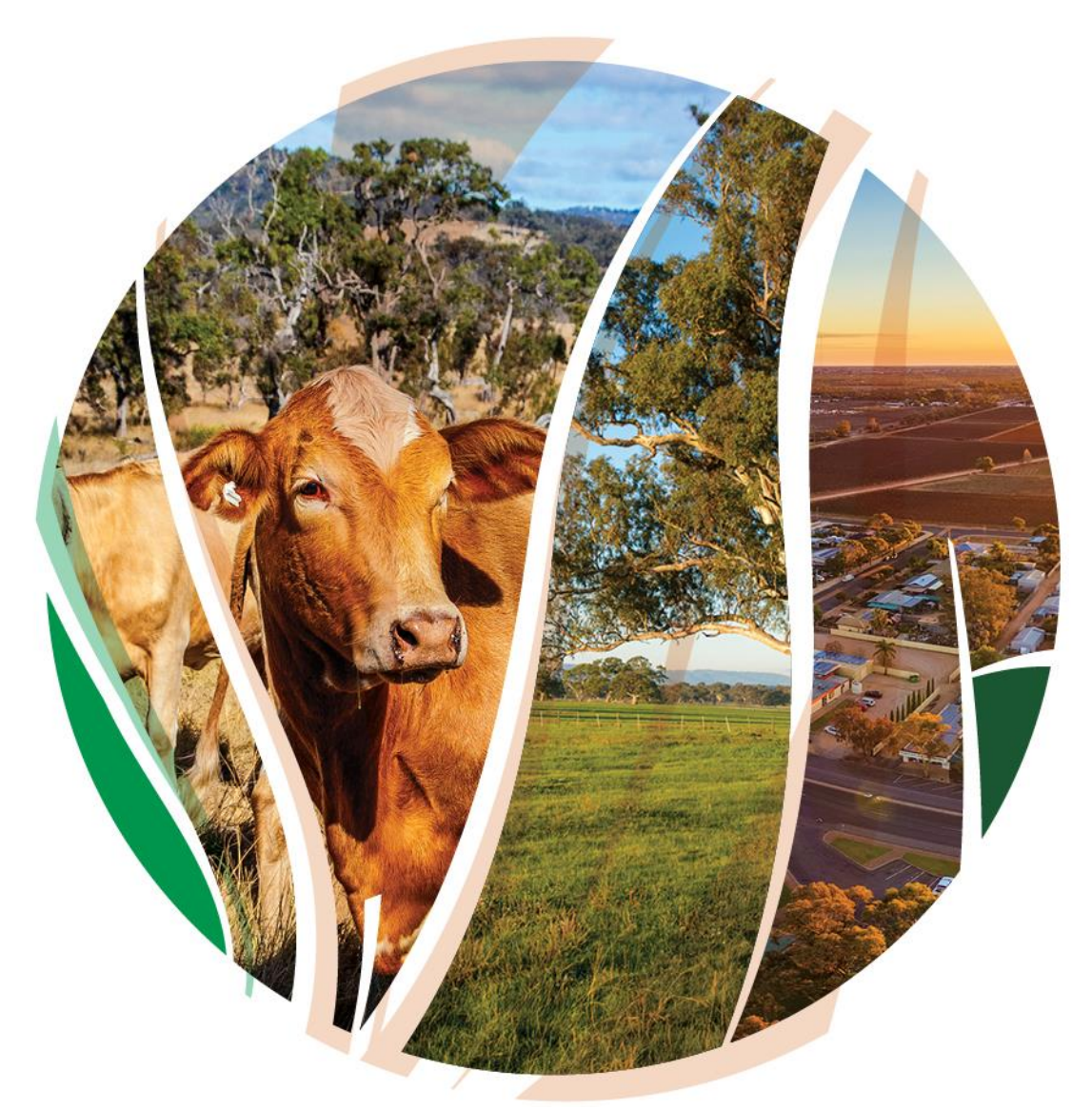
Agriculture Biodiversity Stewardship Package Enhancing Remnant Vegetation Pilot Guidelines