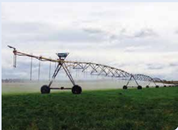
Soil moisture monitoring is used on 'Oakdene'