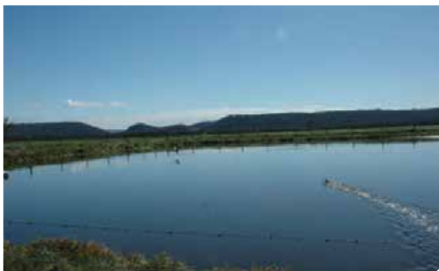
Effluent storage for 900 cow herd at end of calving. Liquids through pivots and solids composted with woodchips from calving pad and spread on worked paddocks. 'Janefield' Meander.

(Compliance audited by Tasmanian Dairy Industry Authority) states effluent must remain within farm boundaries, there must be an appropriately designed and managed effluent system and effluent must be distributed around the farm in an environmentally sound manner (rule of thumb is minimum 10% of farm area).