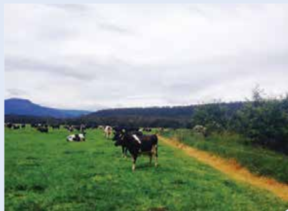
Meander River fenced off on 'Beaufield'