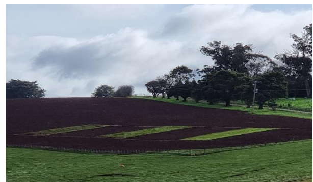
Figure 1. The cover crop on the trial site was clearly visible to motorists on the Scottsdale-Bridport Road.

The difference between the notch and soil level was measured on each peg, by hand on 17 November.