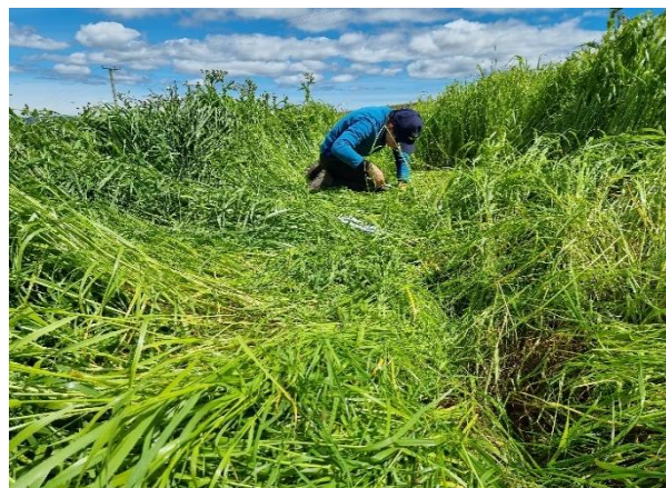
Figure 2. The fertile soil and high rainfall resulted in vigorous growth in the cover crops.

This is an excerpt from the full report. **These costs were produced using the Tasmanian Erosion Economic Calculator and include the cost of lost topsoil carbon, lime and major nutrients and the relevant costs of tillage, seeding and spraying for each treatment.