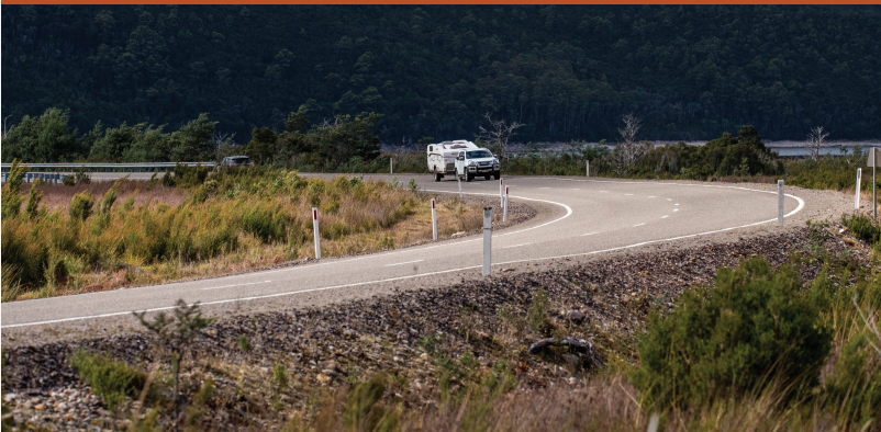
Plans are underway to protect Tasmania’s iconic West Coast from invasive weed threats

Cradle Coast NRM and Biosecurity Tasmania coordinated a meeting of major stakeholders in November 2022, which identified the need for a cross-tenure weed action plan to ensure key priorities are addressed.