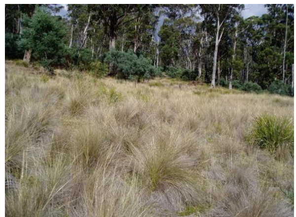
Bottom: Poa grassland