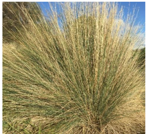
Top: Silver tussock - Poa labillardierei ,

Threatened Species Scientific Committee. (2009). Approved Conservation Advice for Lowland Native Grasslands of Tasmania ecological community.