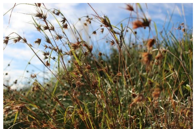
Themeda triandra (kangaroo grass)

There are two main sub-communities of LNGT, differentiated by their dominant tussock-forming grass: Lowland Themeda triandra (Kangaroo Grass) grassland, and Lowland Poa labillardierei (Silver Tussock Grass) grassland. Themeda grassland tends to support a much higher diversity of herbs, lilies and orchids than Poa grassland, where the dominant tussocks can be tall and quite densely packed.