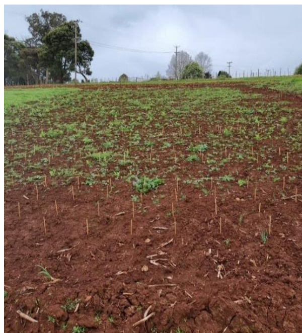
Figure 6. Weed coverage on the fallow plots could not be sprayed out through October due to wet and windy conditions.

As expected, the combination of contour-ripping and cover crop was the most effective treatment in reducing erosion. However, it was only marginally more effective than cover cropping alone, while carrying the additional cost of the soil ripping.