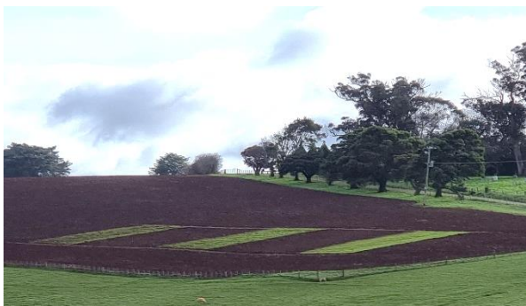
Figure 2. The cover crop on the trial site was clearly visible to motorists on the Scottsdale-Bridport Road.

Early winter rainfall meant that machinery could not be used on the site, therefore, trial plots were established by hand. This involved smoothing out the rip lines to create a flat seed bed on two of the five plots. Tama annual ryegrass seed was spread on three of the plots. On 30 June, 190 notched bamboo pegs were inserted into the soil on each plot. The notch of each peg was flush with the soil level and placed in a standardised pattern across all plots.