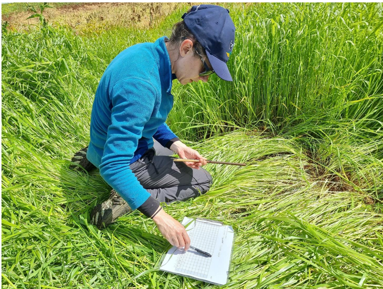
Figure 7. The erosion-monitoring pegs were measured and removed by NRM North staff on 17 November. Staff measured the difference between the soil height and the peg notch. The 950 data points were calculated for mean and median soil height difference found in Table 1.

Thank you to Elders Scottsdale for sponsoring the Hillslope Erosion Trial Christmas Wrap-Up dinner and to Frank Mulcahy (PotatoLink), Ian Parr (Plant Diagnostic Services) and Ossie Lang (RMCG) for donating their time to speak at the event.