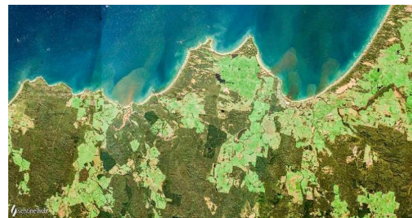
Figure 1. Satellite image of Pipers, Brid, Forester estuaries and sediment plumes following heavy rainfall. Image taken 18 July 2021.

The trial sites were established to investigate the cost-benefit ratio of different erosion control methods and build awareness of hillslope erosion. Using these results, NRM North aims to demonstrate the cost-effectiveness of protecting soil from erosion.