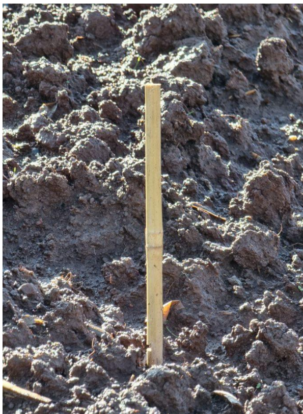
Figure 5. One month through the trial, soil level change was already visible.

The Jetsonville trial results and economic analysis contribute further evidence to the 2019 trial at Weetah that spending money on cover crops or tillage to reduce erosion risk through winter and early spring is most often a cost-effective investment in Tasmania's higher-rainfall agricultural zones.