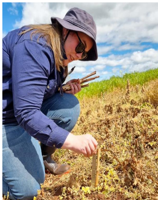
Figure 4. Steel rulers were used to measure the difference between soil surface and peg notch.

After the cover crop was sprayed, contractor availability, wet and windy conditions meant the bare plots were not able to be sprayed until the start of November. As a result, the plots designed to remain fallow had grown a mat of weeds during the last two months of the trial, reducing erosion.