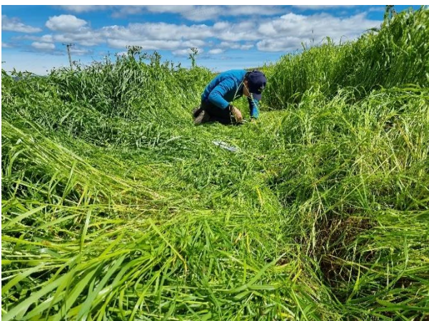
Figure 3. The fertile soil and high rainfall resulted in vigorous growth in the cover crops, making it challenging to find the erosion monitoring pegs for measuring.

The ripped, cover crop treatment intended for early termination (a practice designed to facilitate breakdown of the cover crop mass in time for Spring sowing of the next cash crop)