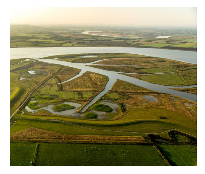
Wetland restoration increases friction in the estuary. Somerset, UK.