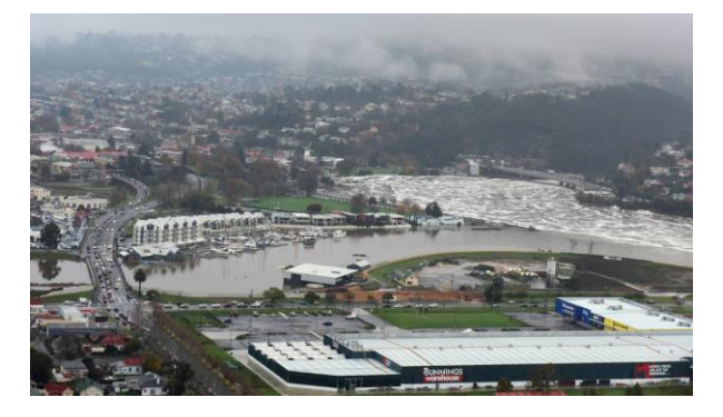
Launceston's flood levees protect many low-lying areas of the city.

The levee renewal program by City of Launceston provides flood protection to certain low lying areas of the city and surrounding suburbs, but changes in climate and sea level are gradually leading to increased flood risks in areas outside those area protected by the levees. One option for reducing the magnitude of impact from storm surge and extreme rainfall events is to increase the friction and the storage volume